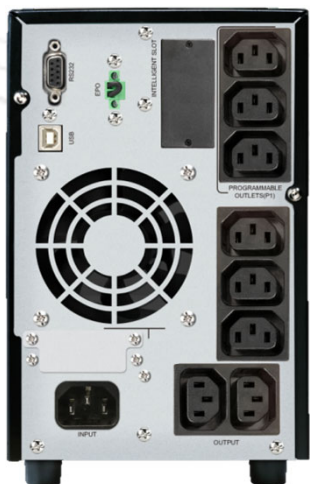
VI 1100-1500 CW IEC