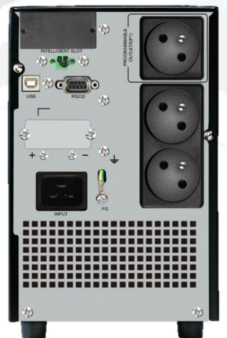
VI 2000-3000 CW French