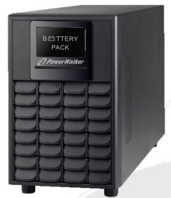
Battery Packs available